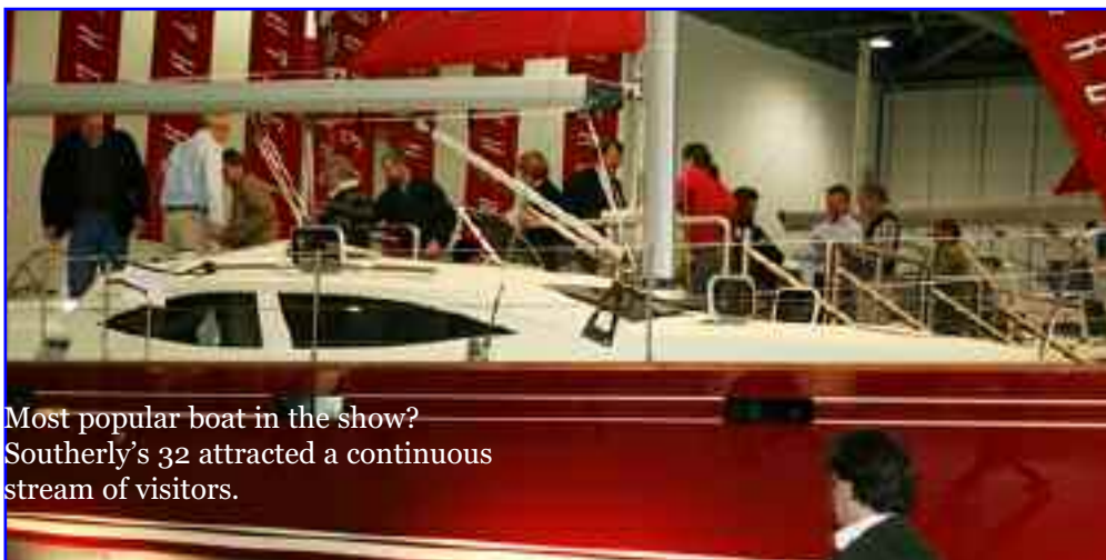
Most popular boat in the show? Southerly's 32 attracted a continuous stream of visitors.

East Coast catamaran builder Broadblue had a scale model of the new Broadblue 500, which is going into production this month. Hulls are being moulded by Cair Paravel at Colchester and furnished and fitted by Goodchild's at Burgh Castle.